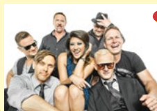
Groove & Tonic Aug 31, Sep 1, 2, 3