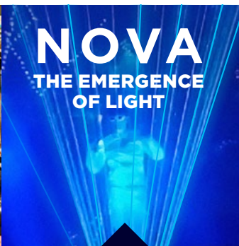
Festival Park Nightly, 10:15pm

Explore more than 150 exhibit booths showcasing classic favourites and brand new products!