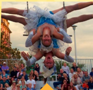
Silver Starlets Daily, 12:30, 3 & 5:30pm

A Canadian cultural mosaic of dynamic dancers, exhilarating music and special guests!