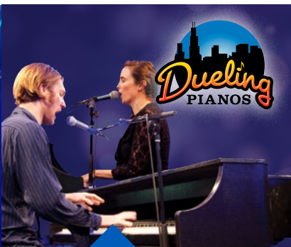
Celebration Plaza Nightly, 7 & 9:45pm

This nightly finale is a futuristic light show that combines cutting-edge visual effects with incredible live performers.