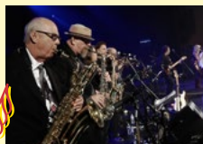
R&B Allstars Aug 26, 28, 29, 30