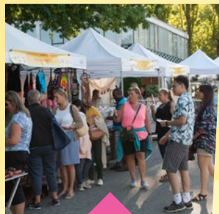
Fall for Local Market Daily, 11am-6pm

An all-female aerial acrobatic show full of glitz, glam & glitter!