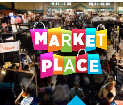
Forum Daily, 11am-11pm

Explore more than 150 exhibit booths showcasing classic favourites and brand new products!