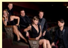
Dr. Strangelove Aug 18, 19, 21, 22