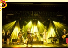
Side One Aug 23, 24, 25