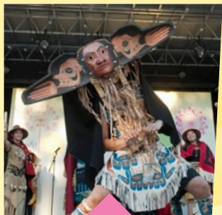
Canadian Showcase Daily, 12, 2 & 5pm

Festival Park is Entertainment Central! Watch a live performance, sing along with a band, and be amazed by the nighttime finale show!