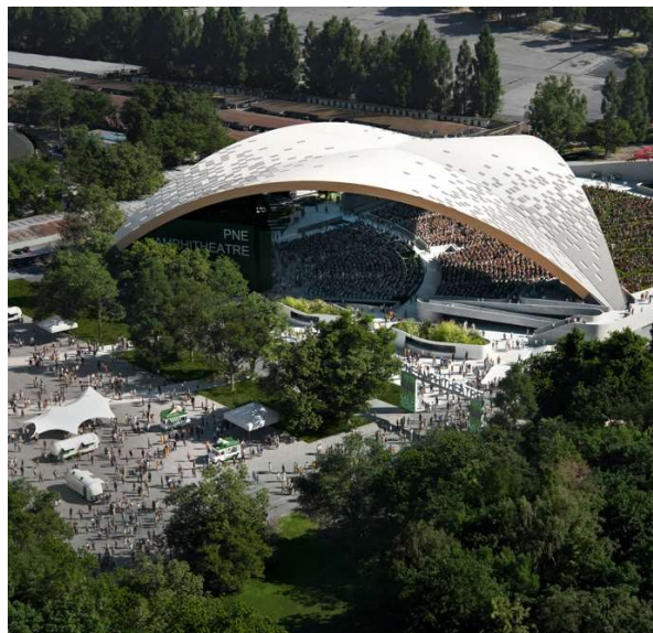
- Artist Rendering, new PNE Amphitheatre

Designed by renowned Vancouver-based architecture company Revery Architecture, construction on the amphitheatre is anticipated to begin in early 2024 with completion in early 2026.