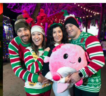
PNE WINTER FAIR